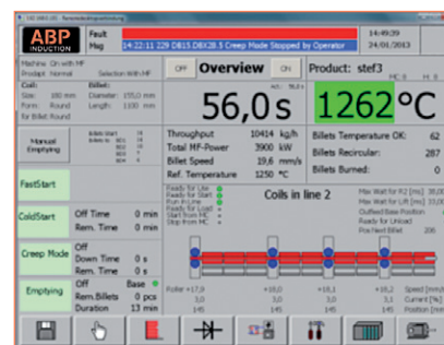
PRODAPT® heating processor